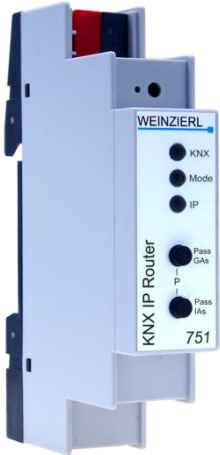
Photo of the device

Compact bus powered Router between LAN/Ethernet and KNX bus